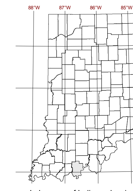
Index map of Indiana showing the location of Perry County